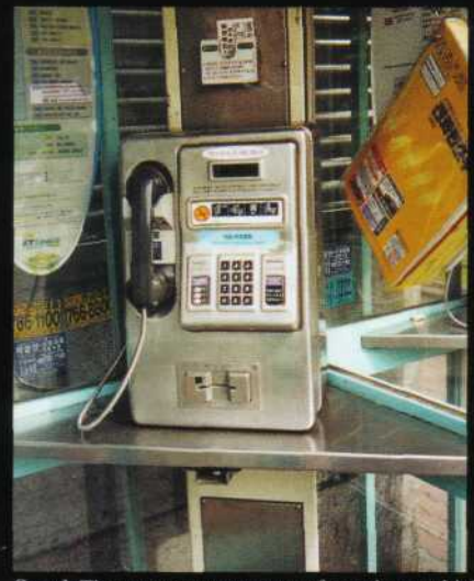
Seoul. The most common type of payphone which only accepts cards.